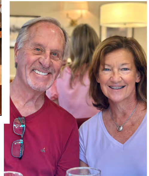
Photos from Cruise Fleet's trip to Jekyll Island