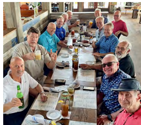
Above: Photos from Cruise Fleet's Trip to Beaufort.